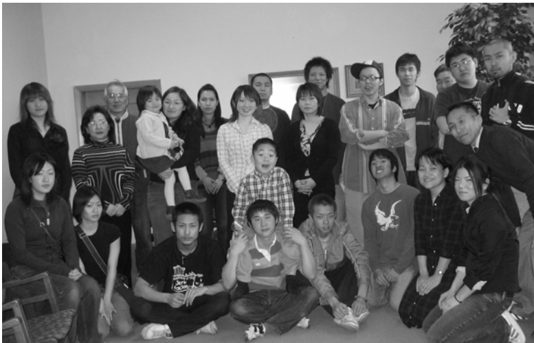
Fellowship time following worship service- March 6, 2005

Please continue to pray for our overall ministry in Lethbridge. □