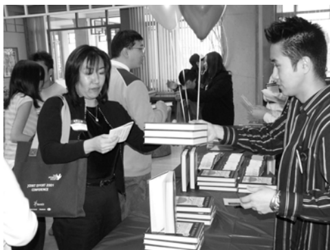
Launching our Campaign at the "Kick Off" Momiji Centre—January 23, 2005

To sum up, in my leadership experience, I've never seen anything like it. God's grace has been amazing. Now that this spiritual campaign is over, the next challenge is about to begin. Plans are now formulated for DAY 41. Our special Kickoff for Day 41 will be Sunday, April 24.