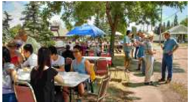
After service Stampede BBQ enjoyed by members, friends & community.

Sunday, July 9 was our annual Stampede barbeque following the worship service. It was again well attended by the local community and church friends. Summer is a busy time at our church. Other events which takes place each year are the Kananaskis Camp in July, Sunnyside Family Camp at Sylvan Lake and Gospel Cup annual softball competition with the Edmonton Japanese Church later in the month of August. Added to this is the annual Calgary Japanese Association Festival at Max Bell Centre which took place on August 12. Our church joined the community-wide festivities by purchasing a booth to sell okonomiyaki, (Japanese pancakes) and also to hand out English and Japanese tracts. As a result of this event, a number of Japanese and other community members have begun attending our church. I believe spiritually hungry people can sense where there may be hope when they are living a troubled life. They can sense that help is available in a Bible believing church. We need to be ready to lead them to the cross of Christ where salvation of their soul awaits them. Praise be to the name of the Lord. □