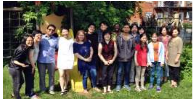
Family and friends: BBQ, Bible study and fellowship in June.

Our BBQ event was well attended. We had many guests, including some family members of our regular participants. After the meal, a Japanese missionary from Toronto led us in a Bible study from the book of Ruth. It was a fun time for everyone and a good bonding time to connect with new people.