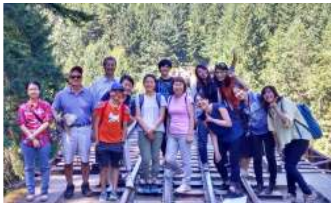
Youth group on one of our frequent scenic hiking trips