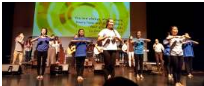
Gospel Night 2017

I especially want to report on the Gospel Night 2017 which we held at Michael J. Fox Theatre on September 9 th . This was the 12 th annual event, and we had the largest number of people at over 400. More than half of them were Japanese non-Christians. When we first started this in 2007 we had about 150 people and most of them were Christians. It is amazing to see how God has blessed this event and beginning to touch others. Over the years a number of people found Christ either directly or indirectly through the Gospel Night. Many were encouraged in their faith and some even found their lifetime spouse.