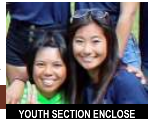
YOUTH SECTION ENCLOSE

Fall 2017 Published by the CANADIAN JAPANESE MINISTRIES