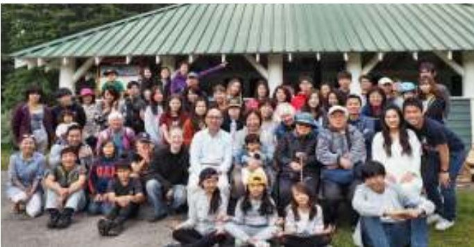
Our annual outdoor service in midst of God’s spectacular creation

May God’s hand continue to be upon all CJM churches and their ministries for the extension of His kingdom. Blessings. □