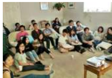
Youth Movie Night

In the past several months, there have been some home group movie nights to connect with international students and other visitors who are staying with us for the duration of their stay in Canada. Through these movie nights, we have been able to engage and invite more people to come to church to get to know our Lord..