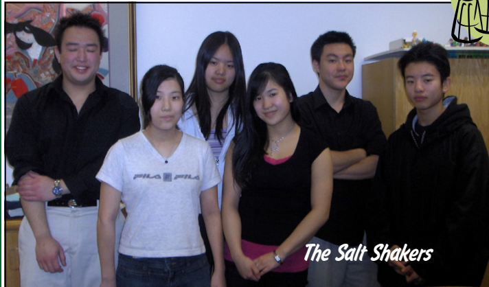
The Salt Shakers