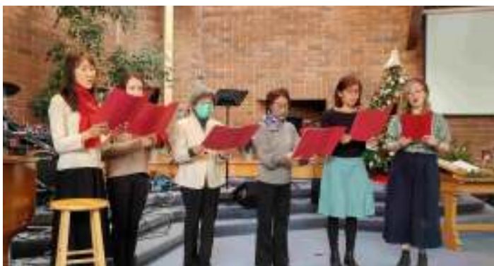
Ladies choir performing during the Christmas service 2021

We ask that you remember Victoria Japanese Church in your prayers. Thank you so very much. □