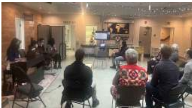
Our Christmas Celebration 2021

We thank God that a new parenting group will be starting in April. Many are joining from Japan. Please pray for God's guidance for this new group. Please continue to pray for the other ministries of the Montreal JCF. □