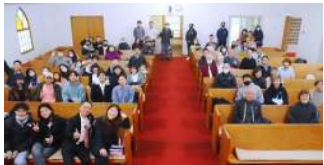
VJGC congregation at the New Year's Service 2022

Please pray that the Lord will bless these goals and policies and that His work will move forward. □