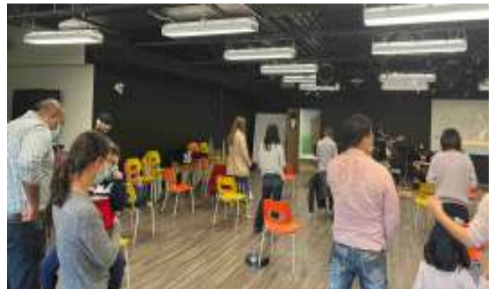
Sunday worship service at Crossover Japanese Church in February