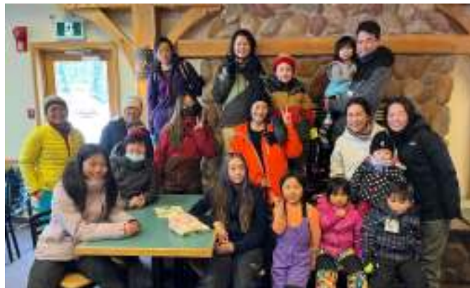
Our Family Ski Fellowship in February