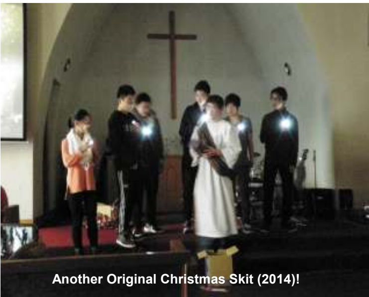
Another Original Christmas Skit (2014)!