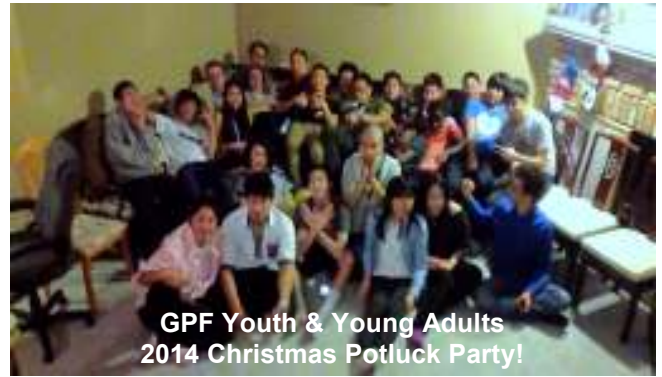
GPF Youth & Young Adults 2014 Christmas Potluck Party!