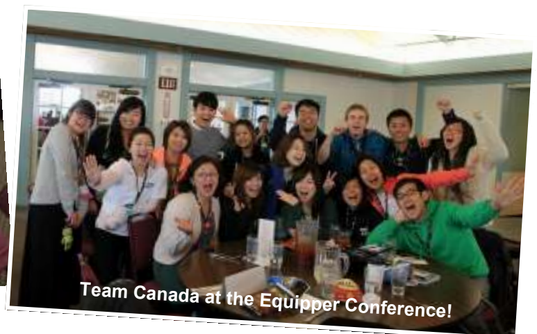
Team Canada at the Equipper Conference!