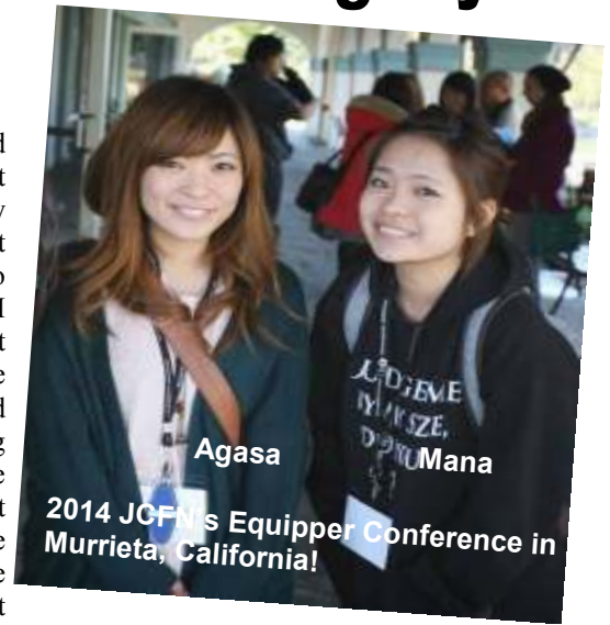
2014 JCFW's Equipper Conference in Murrieta, California!

I wrote down my inner thoughts, regrets, and the stuff I had sealed within myself on a piece of water-soluble paper that was provided for us during the session. Afterwards, we put the paper in a bucket filled with water and watched the paper slowly melt. The purpose of this was to get all of the dirty stuff out of us and cleanse ourselves. This way, we were able to bring back our 'natural beauty'. As I watched my paper, I prayed to God for forgiveness. Once I got back to Calgary, I ended my relationship with my non-Christian boyfriend in order to have a closer relationship with God. This was an extremely difficult decision for me for we still had feelings for each other. But with a lot of support from my ec14 friends and my family, and most of all, God, I was able to accept it and move on. To close this, I would like to once again thank God for rescuing me from my separation from Him.