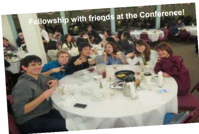
Fellowship with friends at the Conference!