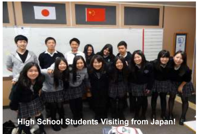
High School Students Visiting from Japan!

Finally, to my fellow youth workers across the CJM, thank you for your sincere love and devotion to young people. Remember, we are not their fathers or mothers (or Saviour). Our burden is not to replace parents, but to support families. God will definitely bless us in that endeavour!