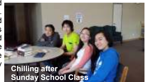
Chilling after Sunday School Class

While the world around us moves with unexpected violent force, the Lord is the same yesterday, today and tomorrow.