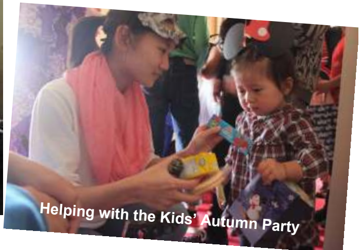
Helping with the Kids' Autumn Party