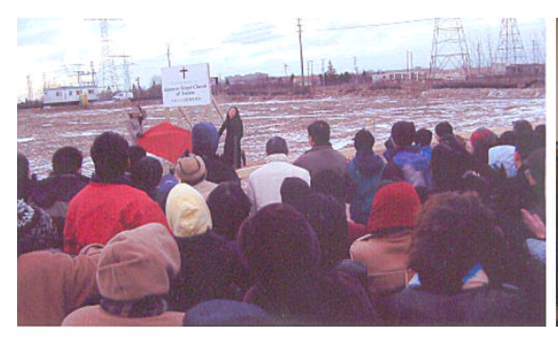
A brief dedication service on the newly purchased church property, (5 minute drive from our current meeting location) Sunday afternoon, December 30, 2001

Church website <a href="http://jgct.dyn.ca">http://jgct.dyn.ca</a>