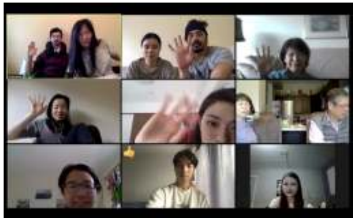
Zoom Young Adults meeting - from Canada and Japan

I think one of the meaningful lessons we have learned together during this period is to trust. We are constantly reminded that we don't have control over anything but ourselves, however, there is one that knows and has power over everything. We are glad to call him our God and in doing so, trust Him for everything. In return, He gives us peace. Hallelujah! □