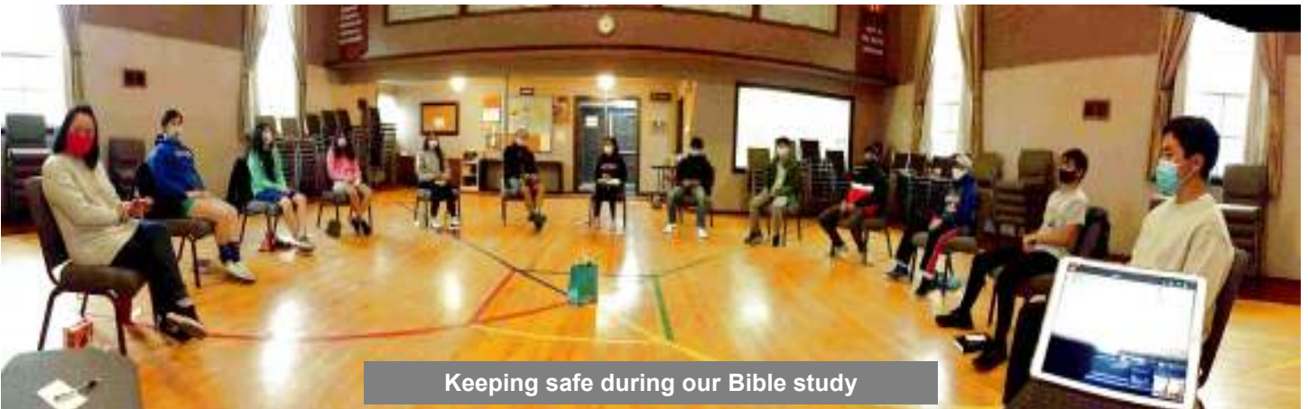
Keeping safe during our Bible study

For those planning to attend the CJM Sunnyside Family Camp, August 2-8, 2021, we look forward to seeing you there! □