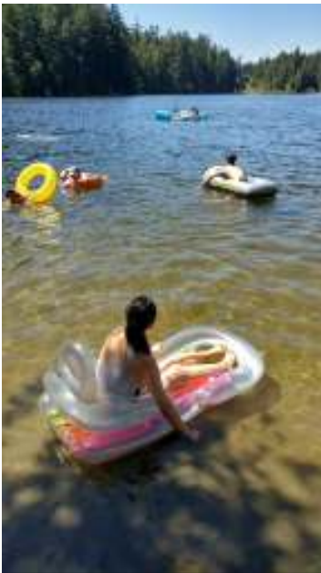
Matheson Lake hike and swim

Praise the name of the Lord! What a crazy year this has been! We are grateful though, for everything that God has taught us in these unusual times and situations. The physical gatherings at church and young adults group have obviously stopped earlier this year, seemingly very suddenly. Not knowing how bad or how long the pandemic would affect our church meetings, we walked after the footsteps of other churches around us to shift to online gatherings using Zoom. We were all missing each other since we could not meet