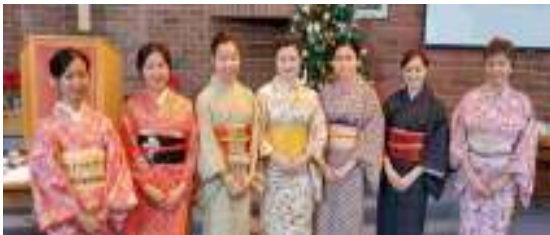
Ladies in their beautiful kimonos for the New Years service

This seemed to invoke heartwarming emotions and memories for the church, as if we were all in Japan.