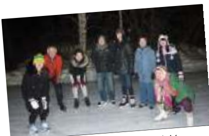
An enjoyable ice skating night

with one another, as we lift up Jesus as the head of our church. Please pray that God will guide us as we seek to select our next board chair. May the Lord's abundant grace and blessing be upon all of you, our brothers and sisters. □