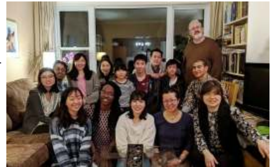
A bi-monthly Bible study and fellowship group