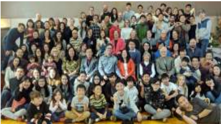
Calgary Japanese Gospel Church / Gracepoint Fellowship congregational photo 2019

Let us rebuke the coronavirus and say, “Stop the infection! Give healings to the patients quickly!” with the authority and the name of the Lord Jesus, who is the Almighty, the ruler over the heaven and the earth - raising our hands in believing prayer. □