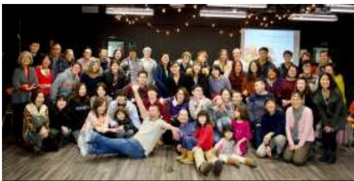
Crossover Christmas celebration 2019

We are unable to give a proper church activity report this spring, however, I am receiving a challenge to ascertain the church's and the follower's standing position during this season of hardship. □