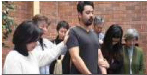
Young couple dedicated as they become members of VJC

It is our prayer that all the churches in Canada will give thanks to our Lord for His blessings, and help us to encourage each other through the work of CJM. □