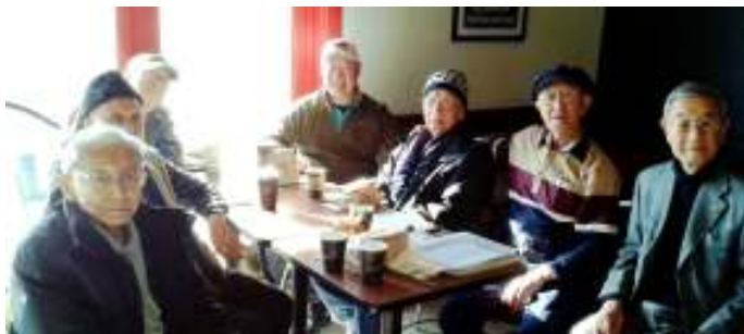
Nikkei Breakfast/Bible group meeting at a local mall restaurant

Today, I am still reaching out to the Nikkei community in Toronto through the Nisei Breakfast/Bible session, twice-a-month in a mall restaurant, and conduct a Gideon Fellowship bilingual Bible Discussion at the New Life Christian Church each Sunday. □