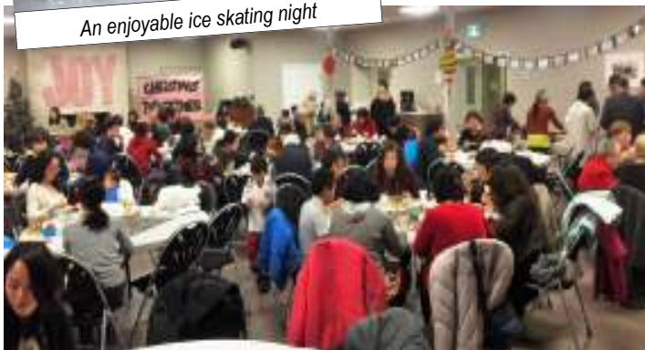
Christmas potluck 2019 following the annual Christmas service