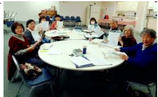
Bible study meeting each Wednesday and alternate Fridays

In the Gospel of John 21:15, Jesus says, "Simon son of John. Do you love me more than these people? Yes, Lord. You know that I love you," Jesus said to him. "Feed my lambs."