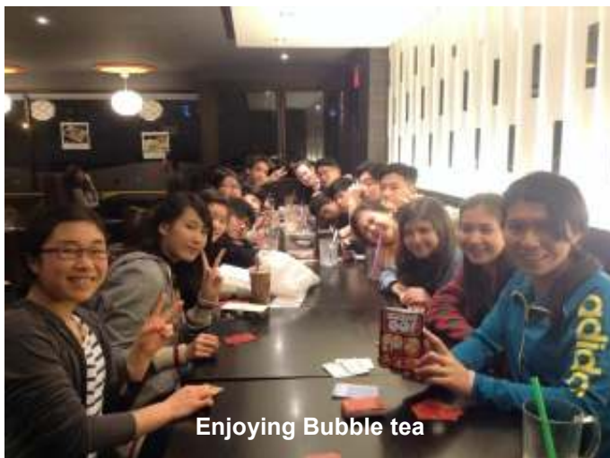
Enjoying Bubble tea