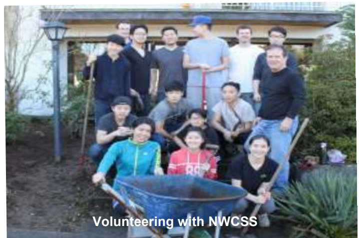
Volunteering with NWCSS

Hello Youth Leaders. Thank you for your contributions to this newsletter. It's so good to hear what is going on in your neck of the woods. We aim to put out the CJM Reporter with the Youth In Action attachment twice a year; our next publication will be in Fall 2016. Looking forward to your article then! Thank you! YIA Editor