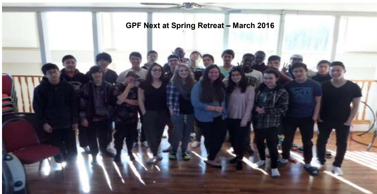
GPF Next at Spring Retreat – March 2016

In March 2016, we hosted our first Spring Retreat at Rivers Edge Bible Camp. The retreat was attended by 25 youth and young adults from Calgary and a couple from Edmonton! It was great to get together once again. We went through David Platt's "Radical" DVD series, in which he challenged us to take up Jesus' call to "take up our cross and follow Him". In the midst of personal struggles, family struggles, economic downturns and worldwide fear, I am thankful to see this group of young people coming to know the God who loves them, cares for them and to whom they can trust and have faith in during difficult times. They also share an awesome unity of brotherhood and sisterhood, coming together as family. Us, leaders get to see them pray together, play together and serve together. There is no greater joy! We praise God, giving Him thanks, for it all!