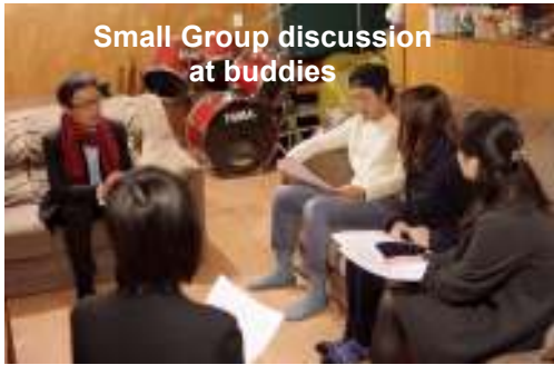
Small Group discussion at buddies