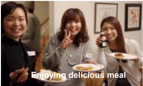
Enjoying delicious meal